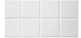
Second Look I panel – Scoring creates nominal 12" x 12" squares