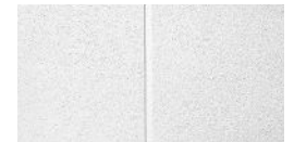
Second Look II panel – Scoring creates nominal 24" x 24" squares