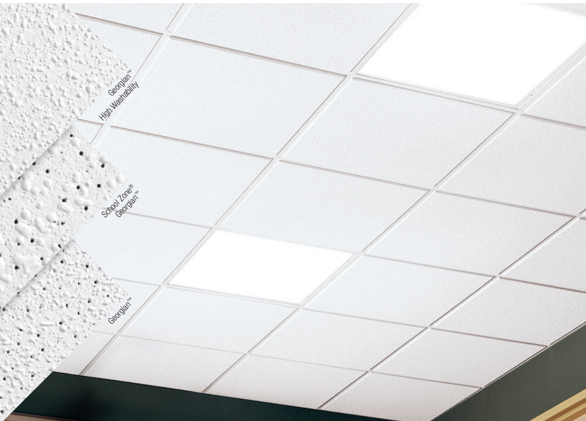
▲ Georgian™ Beveled Tegular panels with Prelude® XL® 15/16" suspension system

CAD/Revit® drawings at: armstrongceilings.com/cadrevit